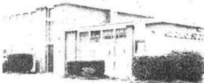
Great Neck School